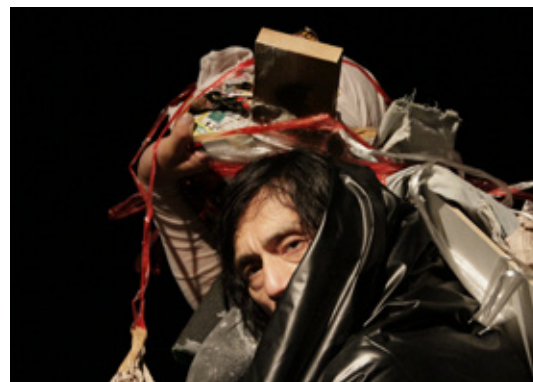
Takao Kawaguchi About Kazuo Ohno

[Dates] Sun 24 May 14:00 [Venue] Sogetsu Hall [Tickets] In advance 3,500yen / On the door 4,000yen